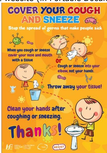
Cover your cough and sneeze (HSE, January 2020)